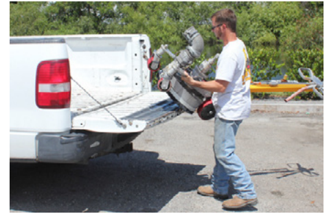
Lightweight and easy to transport