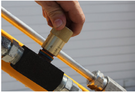
Hydraulic needle valve precisely controls the rpm