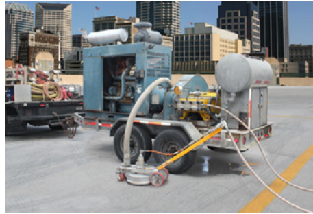
Easily connects to any 40,000 psi pump